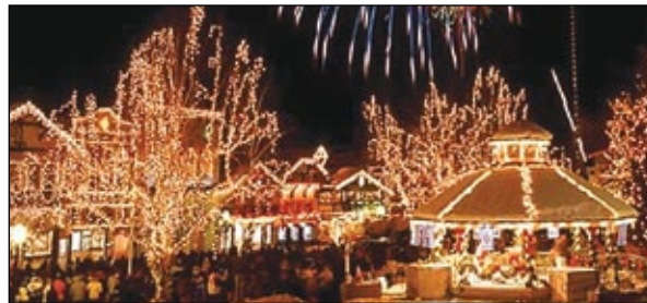
The Bavarian-themed town of Leavenworth in Eastern Washington is awash in lights during the holiday season.

So, pull on your boots and mittens, pile the family in the car and head out for some outdoor fun that will make the winter fly by! We've put together a short list of some fun activities that you can enjoy only a short drive away from here.